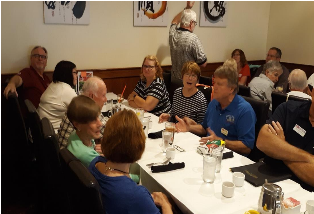
Everyone awaits dinner at the Ho Ping House