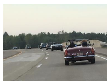
Michiana Brits On the Road Again

Material is subject to editorial revision and opinions expressed are those of the authors and do not necessarily reflect those of the 2019 Michiana Brits, Ltd., British Car Enthusiasts